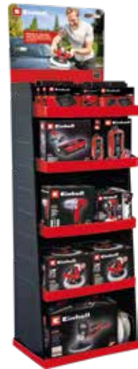
■ Display Car Accessories Mix 1 60 x 40 cm