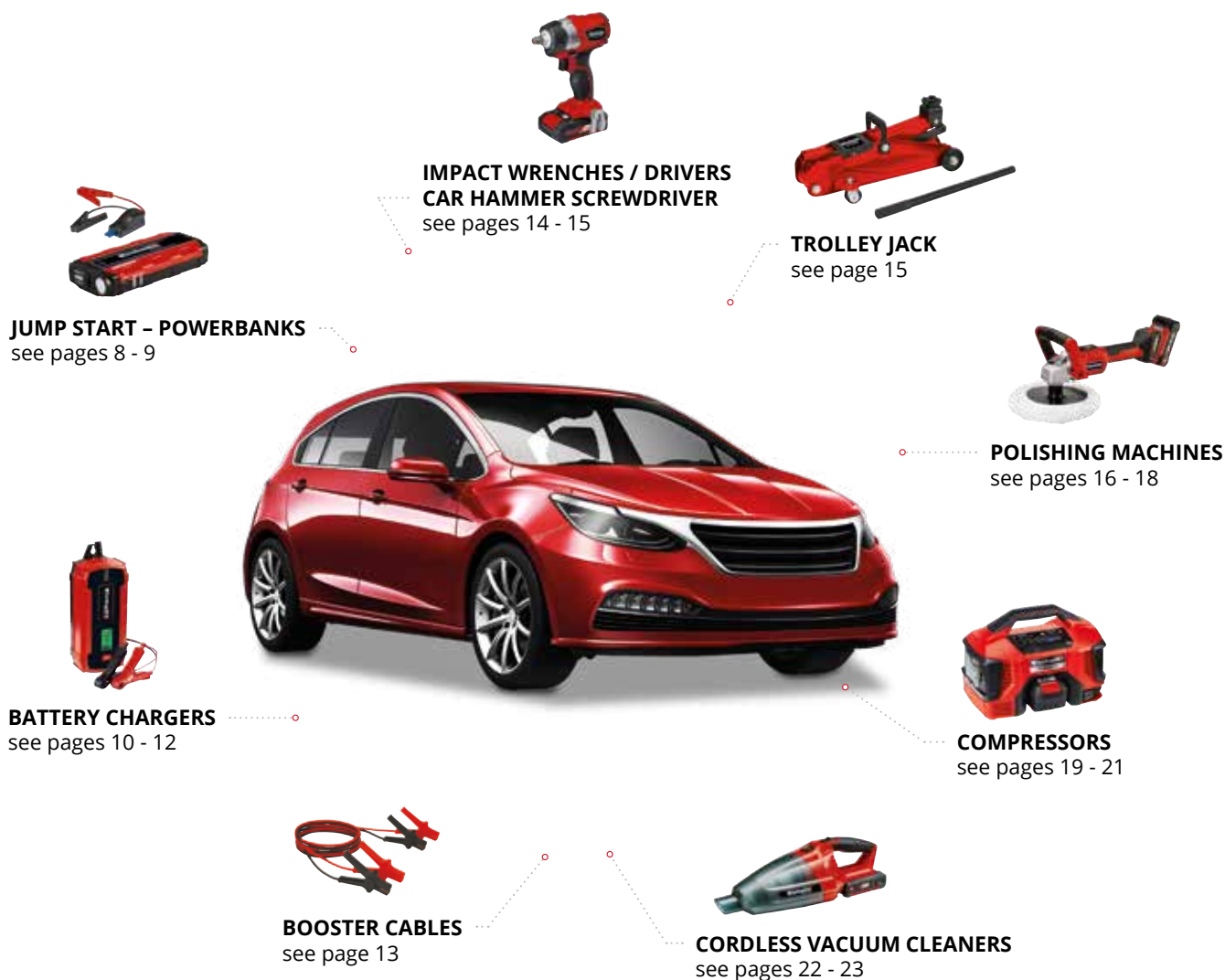
JUMP START – POWERBANKS see pages 8 - 9