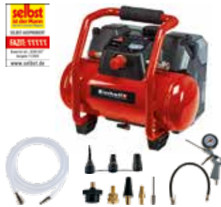
TE-AC 36/6/8 Li OF Set - Solo EXPERT NEW