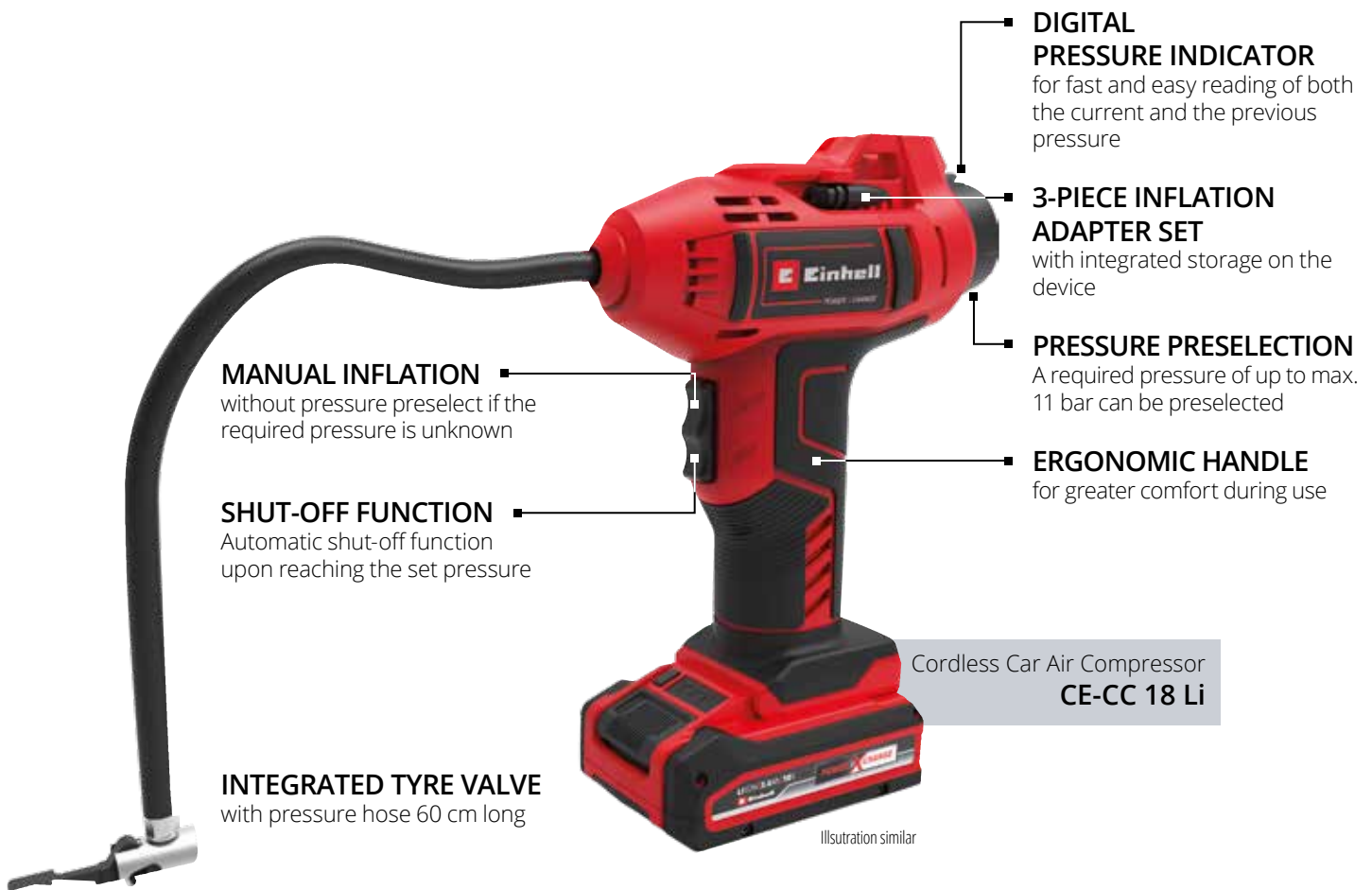
Cordless Car Air Compressor CE-CC 18 Li