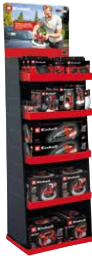
■ Display Car Accessories Power X-Change 60 x 40 cm