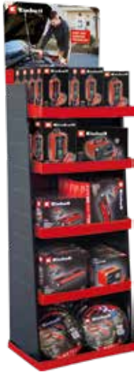
■ Display Starting/Charging Systems 60 x 40 cm